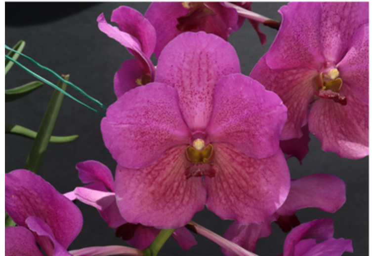
Papilionanda Memphis Neon Hummingbird 'Grace' AM/AOS of 85 points owned