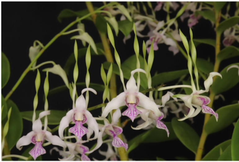
Dendrobium antennatum 'Palace' AM/AOS of 84 points owned by Louisiana Orchid Connection