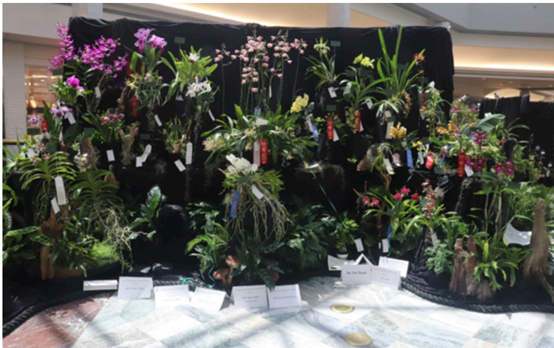
Show Trophy to Gulf Coast Orchid Society