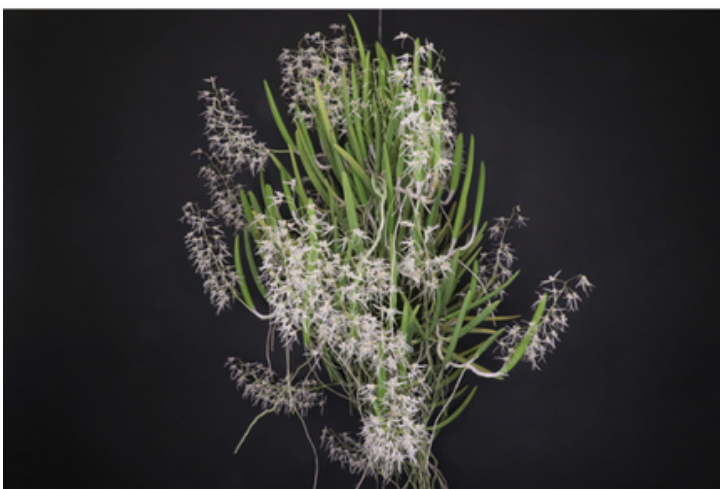
Dendrobium wassellii 'So Orchids' CCM/AOS of 83 points owned by So Orchids