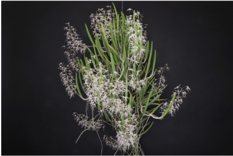
Dendrobium wassellii 'So Orchids' CCM/AOS of 83 points owned by So Orchids