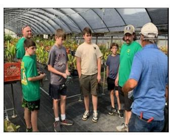
Scouts ready to receive their marching orders