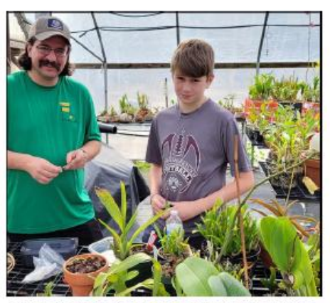
Replacing old and broken labels with new tags