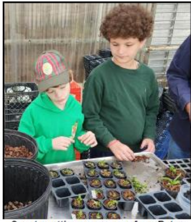
Scouts potting up crosses from Baton Rouge Orchid Society members