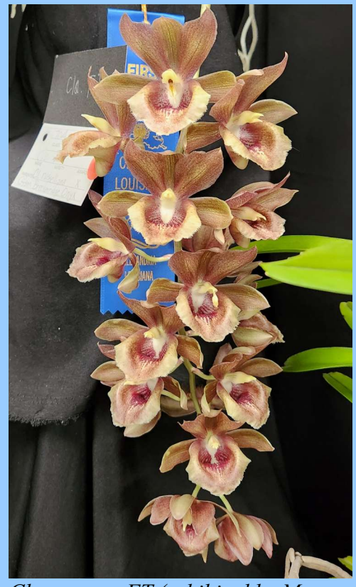
Clowesetum FT (exhibited by Meta Flanagan)