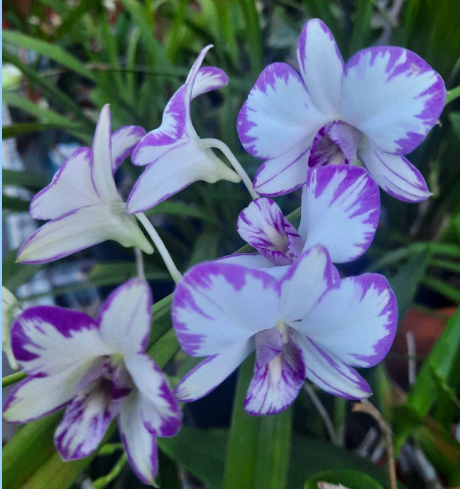
Den Enobi Purple 'Splash' 75% bigibbum

I have always said that dendrobiums are among my favorite orchids. Now I have another reason to appreciate them. They thrive in hot weather and reward me with lots of flowers in the fall.