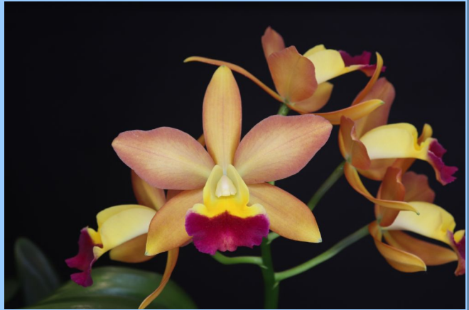
Rhyncattleanthe Tropical Upgrade 'Haley'