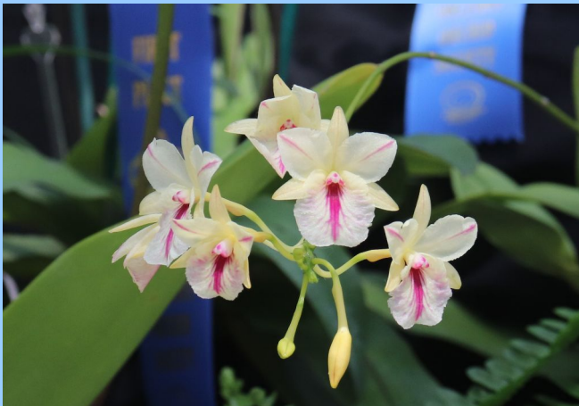
Broughtonia sanguinea v. aquinii v. aurea