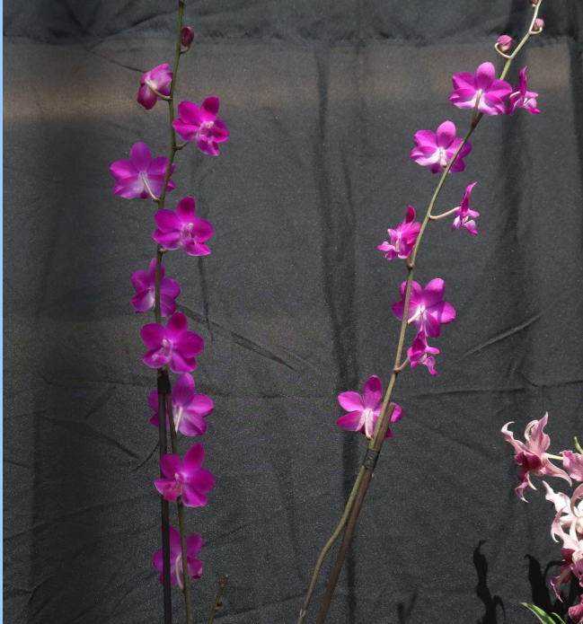
Phal Summer Wine x pulcherrima