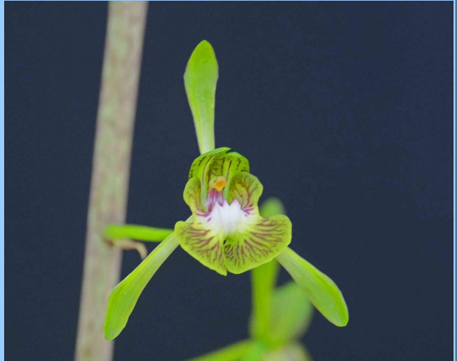
Oeceolakes calcarata 'Louisiana' HCC/AOS 78 pts Exhibited Al Taylor