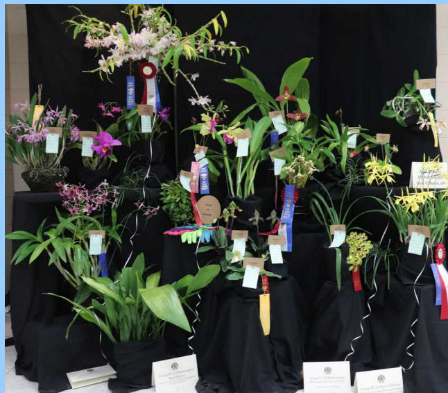
NOOS Exhibit at GCOS Show

Congrats to all who participated or sent plants. The NOOS got 2 nd place for society 50 sq ft exhibit and 14 of the 18 plants entered brought home ribbons. Two plants from other exhibits got AOS awards and 2 other exhibits got AOS certifiates.