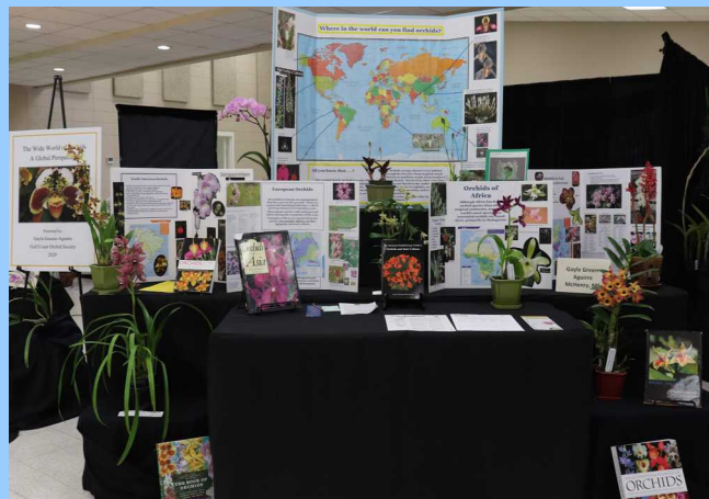
Educational Exhibit 90 points