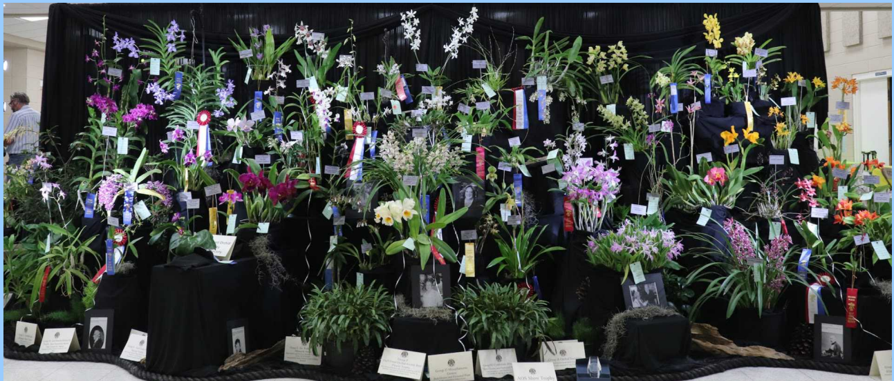
Gulf Coast Orchid Society Exhibit - AOS Silver Certificate 84 points