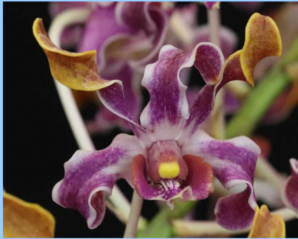
Den. Jairak Spin 'Amore' AM/AOS 82 pts Best Flower in Show