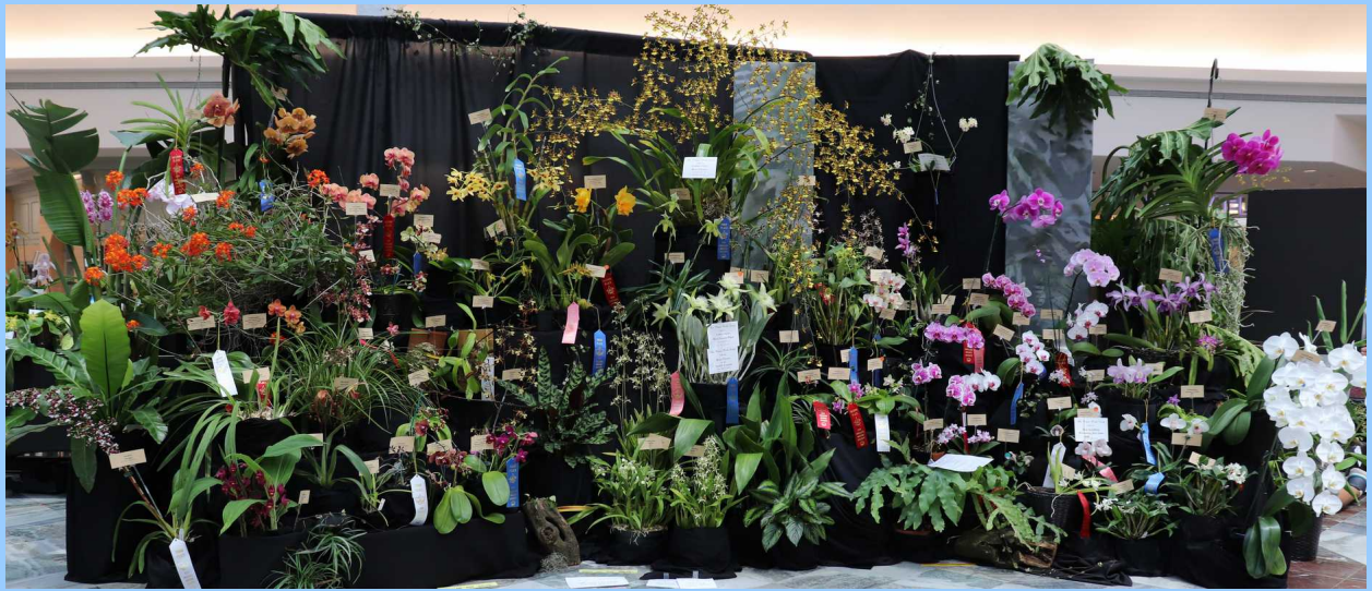
NOOS Exhibit AOS Silver Certificate 85 pts