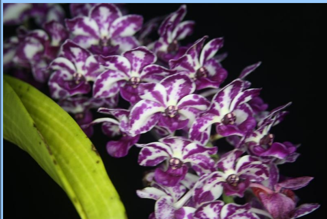
Rhynchostylis gigantea 'Movella Spots' AM/AOS

Rhynchostylis gigantea has definitely become a collector's item in recent years with ever more unusual color forms being introduced into the marketplace. The unmistakable spicy fragrance is consistent across this genus, whether the species blooms in the winter or summer. One species, Rhy. retusa, is referred to as the "fox tail" orchid because of its long tapering inflorescence. The inflorescence of Rhynchostylis gigantea is somewhat shorter, the actual length being determined by genetics and culture of the individual plant. There is something exotic and magical about walking into a winter greenhouse and encountering the warm fragrance of Rhy. gigantea. It leaves a lasting impression one looks forward to year after year.