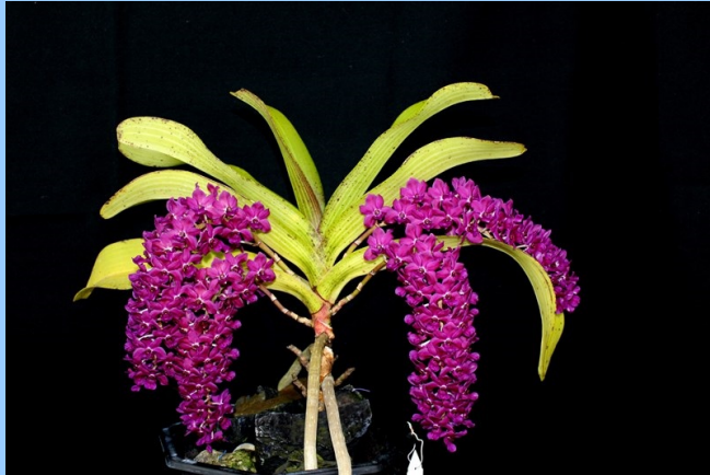
Rhynchostylis gigantea 'Jo Ann's Valentine' AM/AOS

Rhynchostylis gigantea has definitely become a collector's item in recent years with ever more unusual color forms being introduced into the marketplace. The unmistakable spicy fragrance is consistent across this genus, whether the species blooms in the winter or summer. One species, Rhy. retusa, is referred to as the "fox tail" orchid because of its long tapering inflorescence. The inflorescence of Rhynchostylis gigantea is somewhat shorter, the actual length being determined by genetics and culture of the individual plant. There is something exotic and magical about walking into a winter greenhouse and encountering the warm fragrance of Rhy. gigantea. It leaves a lasting impression one looks forward to year after year.