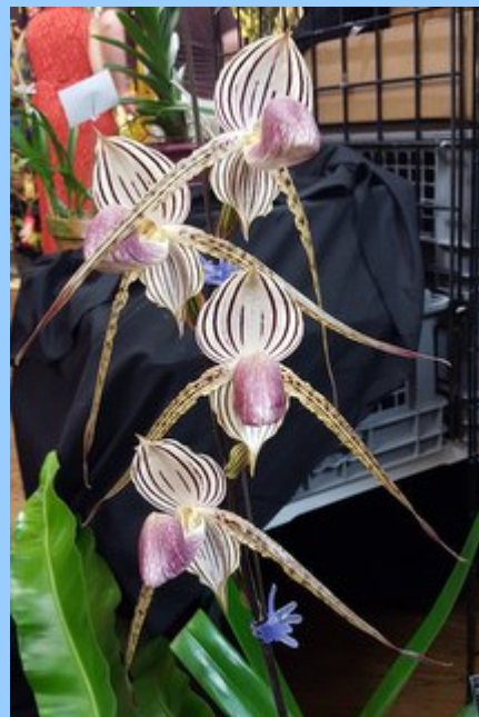
Paph. Lady Isabel