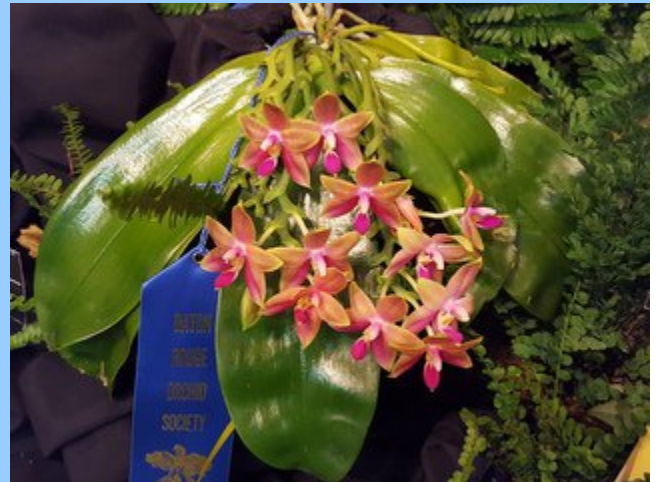
Phal Princess Kaiulani